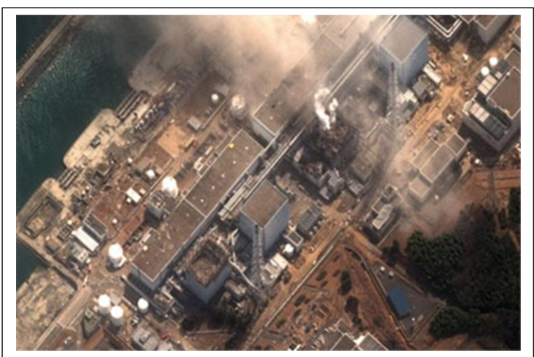
Satellite view of the Fukushima-Daichii nuclear power plant on March 16, 2011, after an 8.9 magnitude earthquake and tsunami set in motion a chain of disastrous events at the facility. See more <u>pictures of</u> the aftermath of Japan's earthquake and Tsunami.

But what happens inside a nuclear power plant to bring such marvel and misery into being? Imagine following a volt of electricity back through the wall socket, all the way through miles of power lines to